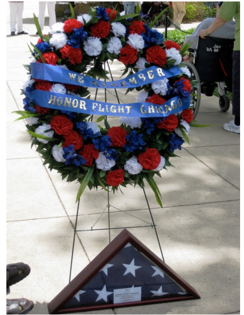
Wreath and Flag for the Chicago Honor Flight