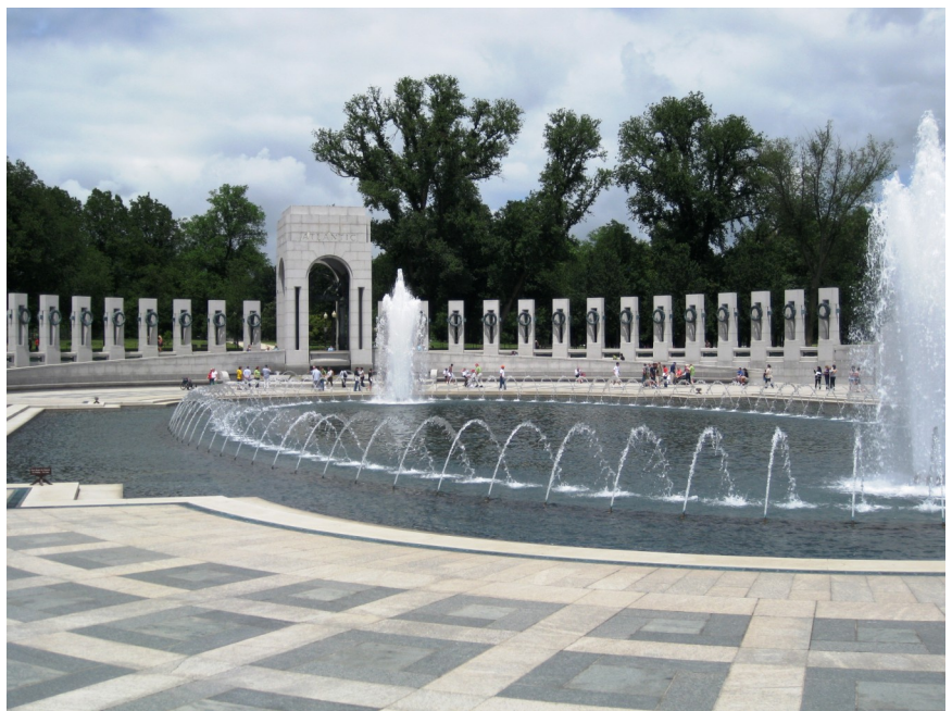
A View of the World War II Memorial in Washington D.C.