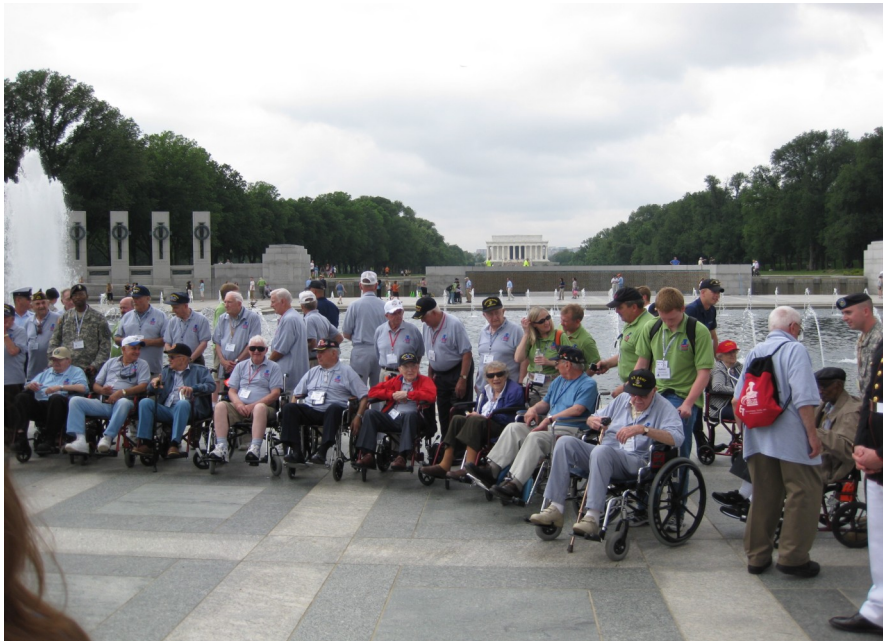
Some of the Vets and their chaperones who were part of the Chicago Honor Flight to the World War II Memorial in Washington D.C. on May 25, 2010